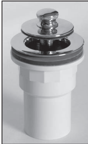
Model 612-PP Spigot Adaptor