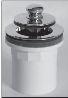
Model 610-PP Hub Adaptor