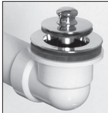
Model 614-PP Drain Elbow