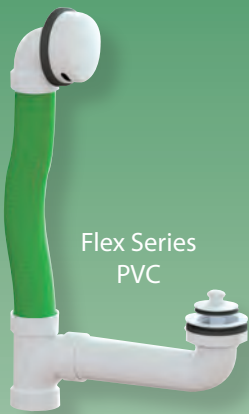
Flex Series PVC