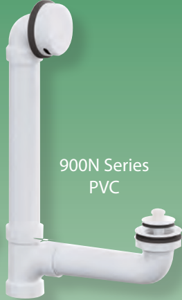
900N Series PVC