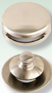
Universal NuFit ®