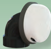
901N Series ABS