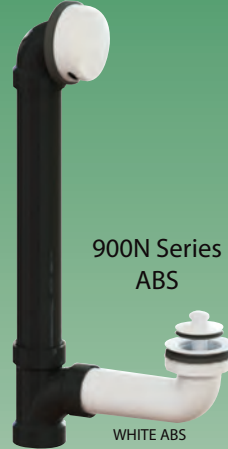
900N Series ABS