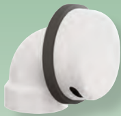
901N Series PVC