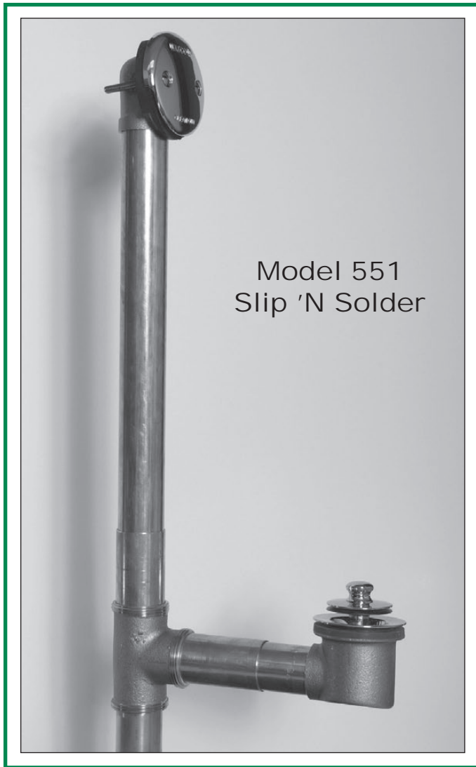
Model 551 Slip 'N Solder