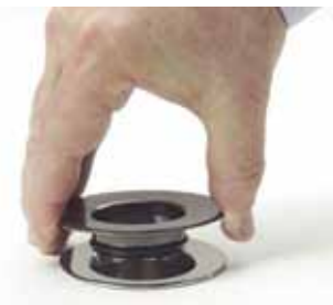
Repair a damaged strainer body or upgrade to a special finish in seconds with QuickTrim™.

Replacing a strainer body poses many problems. First, the threaded joint between the strainer body and the drain elbow has been tested and proven reliable. When you remove the strainer body, you break the seal and lose the integrity of the test. Strainer bodies are metal and have male threads. Most drain elbows are plastic with female threads. When replacing a strainer body, it is very easy to cross-thread, which often results in a leak, possibly requiring cutting through the sheet rock