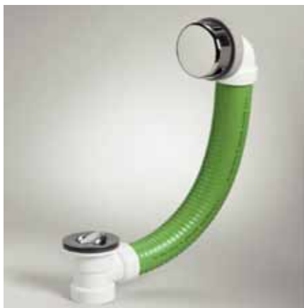
The WatcoFlex® is a completely pre-fabricated bath waste that installs in 2-3 minutes.

The WatcoFlex® is a customized, pre-fabricated complete bath waste that is designed to fit a specific tub. It comes sealed and tested from the factory and is warranted for five years from the date of installation. It arrives at the jobsite ready to install in minutes, eliminating