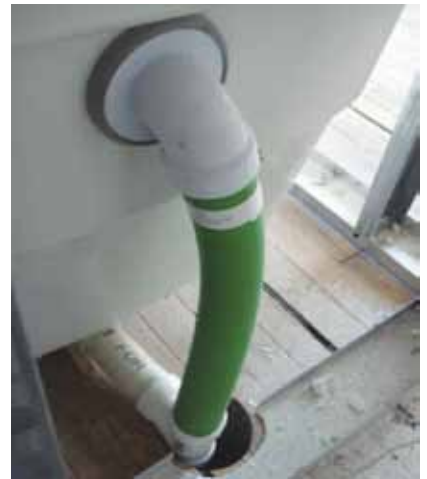
The Flex 900 Innovator® Series compensates for misalignment without installing extra fittings.

Watco introduced the Flex 900 Innovator® Series to address these issues. This is identical to the standard 900 Innovator® Series except flexible tubing is used in place of rigid PVC pipe on the overflow extension. The drain extension remains rigid PVC pipe. The overflow elbow is factory-sealed to the flex tubing. The flexible tubing/sanitary tee joint is left for the contractor to cut and fit in the field utilizing standard