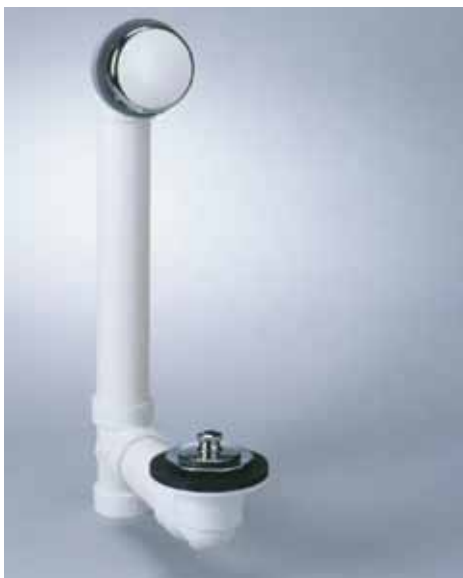
The complete 900 Innovator® Series bath waste.

Watco also provides the option of ordering each unit broken down separately into Rough-In kits and Stopper-