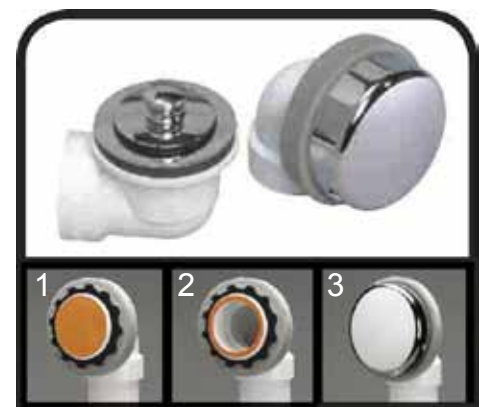
The 900 Innovator® Series testable half-kit: 1. Overflow elbow installed and ready for testing. 2. Membrane is easy to remove. 3. Overflow plate snaps on.

After the system is tested, you simply and quickly cut or punch out the membrane. The membrane is a bright orange